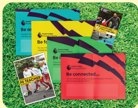
Premier League Primary Stars Values Cards

The PL Primary Stars Programme is a lot more than just football!