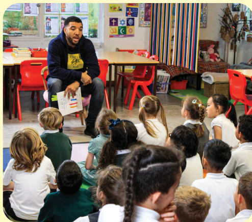
Troy Deeney reading to pupils at Bromet Primary School.