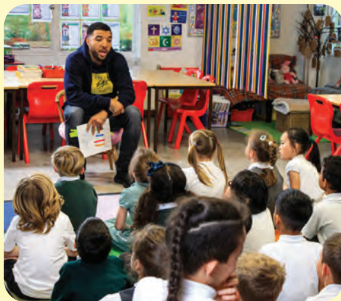
Troy Deeney reading to pupils at Bromet Primary School.