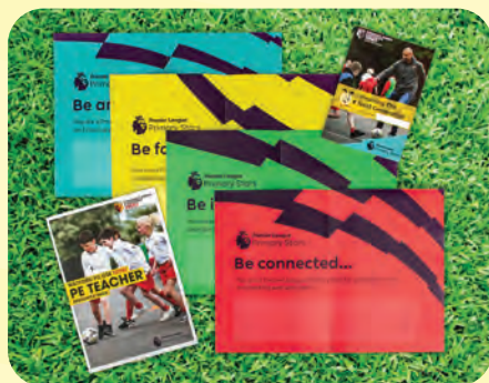
Premier League Primary Stars Values Cards

The PL Primary Stars Programme is a lot more than just football!